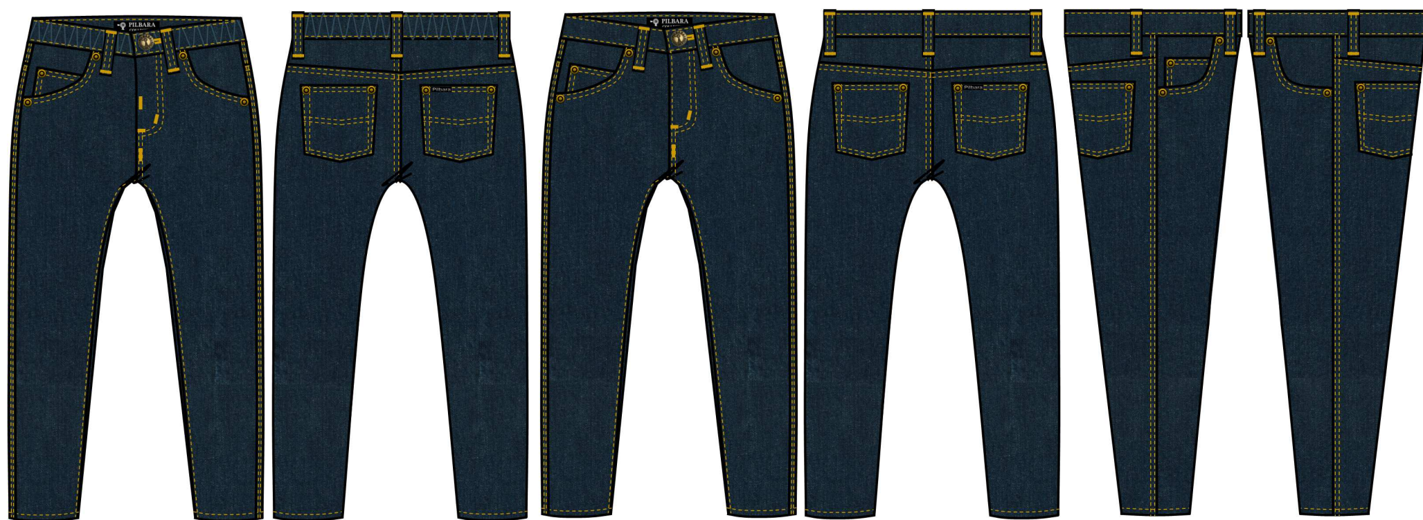
Indigo Blue with Hand Make Distressed Look